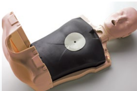
Audible clicker mechanism increases student's confidence in administering adequate compressions.