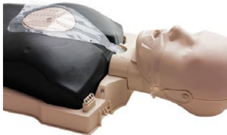
Easy to insert, non-slip face shield and lung bag speeds setup of the manikin.

'Helping students to experience CPR learning realistically'